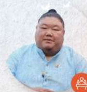
Temjen Imna Along Minister of Tourism and Higher Education of Nagaland