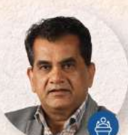
Amitabh Kant Ex-G20 Sherpa, Government of India