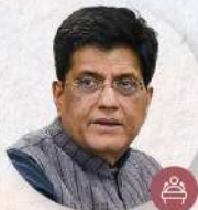
Shri Piyush Goyal Hon'ble Union Minister for Commerce & Industry